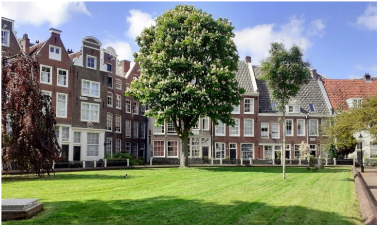
The Begijnhof and the community's original church