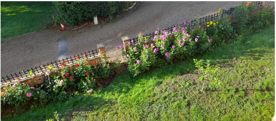
The view from my window