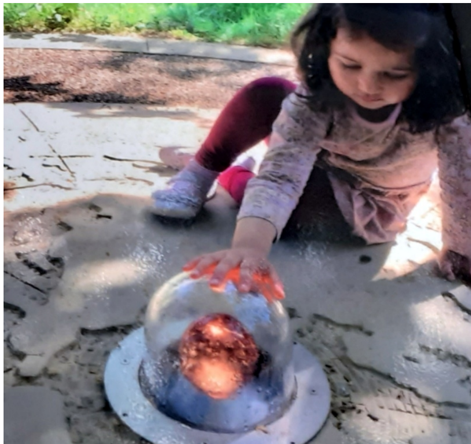
The World Peace Pathway at Kingsley Hall

Bromley and Sheppard's Colleges London Road, Bromley BR1 1PE