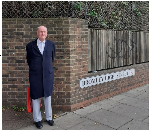
Bromley High Street (the other one!)